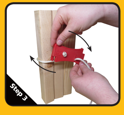
STEP 3: Twist BowTie Clamp in a clockwise motion to reach desired tightness.