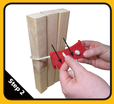
STEP 2: Bring rope around and lock in slot.