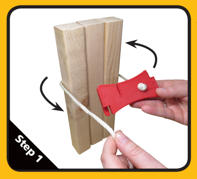
STEP 1: Wrap rope around odd shaped object.