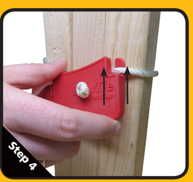
STEP 4: Use the hook on the BowTie to lock and hold BowTie Clamp in place.